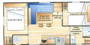
Ex. mobile home organization 3br.

10 « PRESTIGE » Mobile homes (0 to 7 yo) 4 with 2 bedrooms 4 to 6 (24 m 2 ). 6 with 3 bedrooms 6 to 8 (32 m 2 ). Same organization as the mobile home with 2 and 3 bedrooms with in addition, extra facilities including a dishwasher, a kettle, and a 160cm bed.